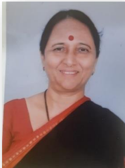
Hon'ble Dr. Surayakanta Patil, President Marathwada Gramin Shikshan Santhan Ex. Union Minister of Rural Development.